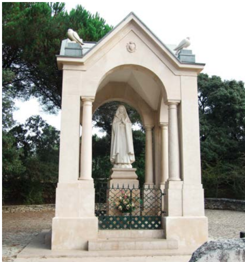
The small chapel erected in the "Valinhos" area. Our Lady unexpectedly appeared here and repeated the promise of a miracle

In October of 1925, she entered the congregation of the Dorothean sisters, where she continued her life of simplicity and perfect obedience. Up until 1929, the majority of her fellow sisters were unaware that she was the seer of Fatima. Her daily duties were simple, and her spirituality was to put into practising the message of Our Lady by living the religious rule perfectly and giving herself